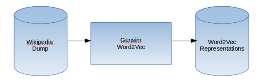
Figure 2. Overview of word2vec flow.