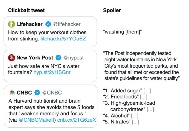
Figure 1: Clickbait tweets and spoilers from the linked web pages (phrase, passage, and multipart spoiler).

The task of clickbait spoiling, as exemplified in Figure 1, specifically aims at completing the "life cycle" of clickbait posts. The creation (Xu et al., 2019) and detection (Potthast et al., 2016, 2018) of clickbait posts are already operationalized, so we