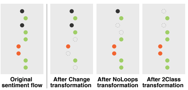
Figure 3. The original sentiment flow from Figure 2 and the resulting flow for each of the three proposed transformations.

NoLoops Deletion of repeating sequences of two or more local sentiments. The rationale is to reduce length differences by merging similar sub-reviews.