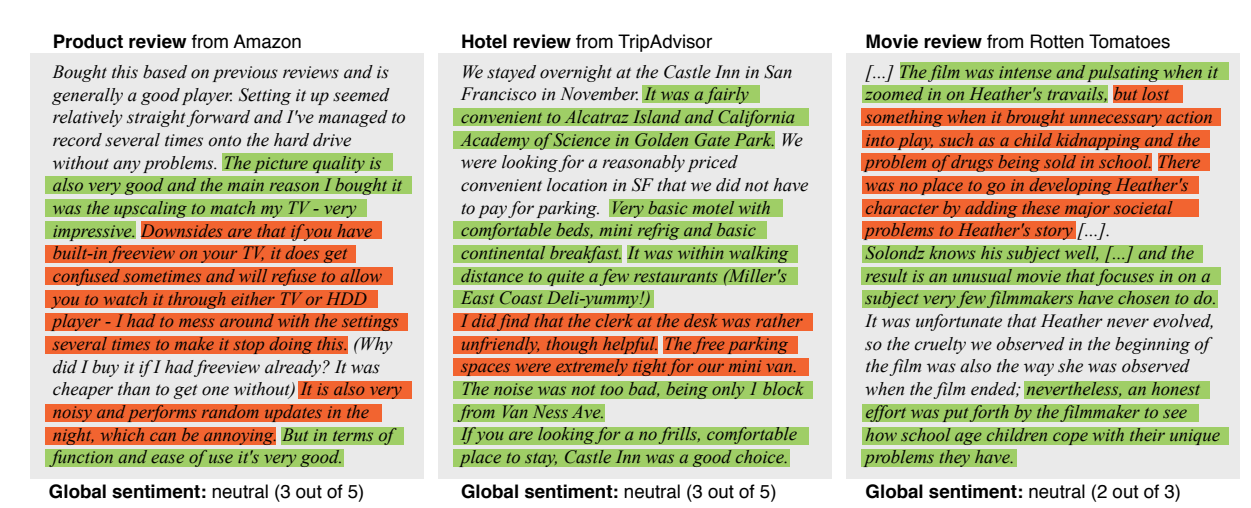
Figure 1. Example web reviews with neutral global sentiment from three domains, taken from the corpora described in Section 5. Corpus annotations of positive and negative local sentiment are marked in light green and medium red, respectively.

the recognition of local sentiment in unknown reviews may still be domain-dependent. We therefore also present a novel edit distance approach to robustly compare flows, when local sentiment is obtained using state-of-the-art techniques (Socher et al., 2013). In systematic cross-domain experiments with the given corpora, we classify global sentiment based on sentiment flow without any domain adaptation. While not being perfectly effective, our approach improves over the domain robustness of strong baselines.